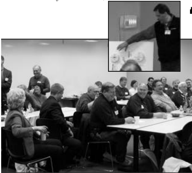
Meet & Greet 2007