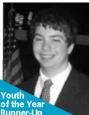
Youth of the Year Runner-Up