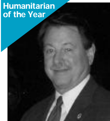
Humanitarian of the Year