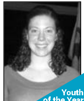
Youth of the Year