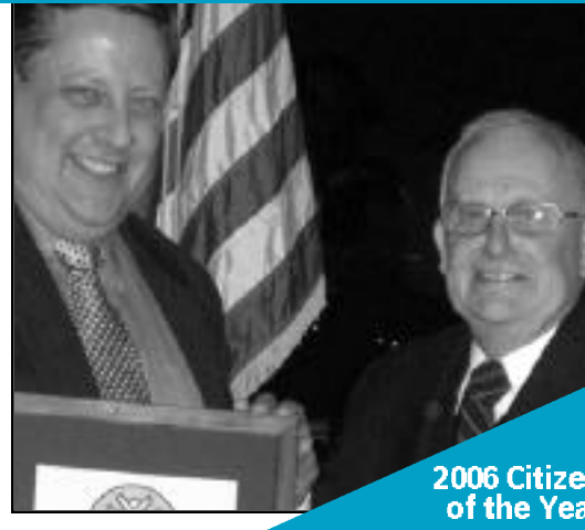
2006 Citizen of the Year