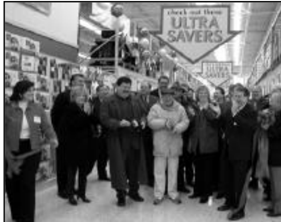
Ribbon cutting at Ultra Foods

Interior work is well underway for two projects in the Ontarioville area. The Hanover Park Animal Care Center and Kinast Distributors are both feverishly working on the interiors of their respective buildings. It appears they are on a race to see who can finish first. No bets please.